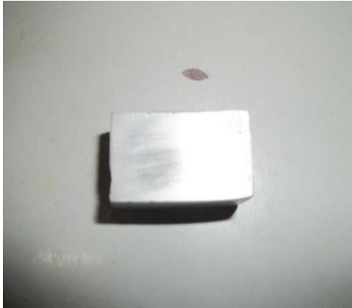
Figure 5: MMC sample prepared for hardness test