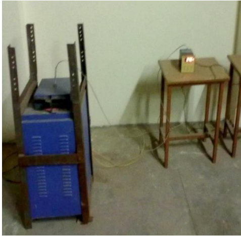
Figure 1 a. Muffle furnace