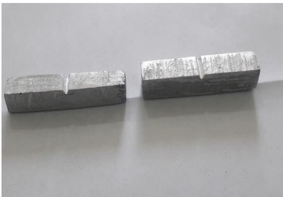
Figure 7: MMC sample prepared for toughness test