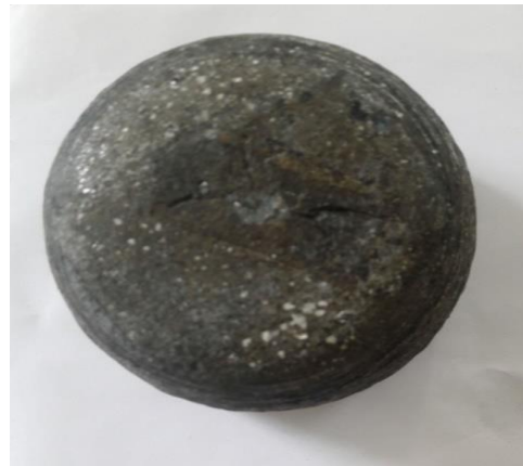
Figure 3: MMC (Al 6351+ 5% of Al_2O_3 )