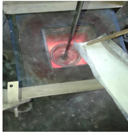
Figure 1 b. Preparation of sample by stir casting

Now the mixed composite after cooling and solidification is cut into desired shapes for testing mechanical properties on the band saw machine. The machine is an