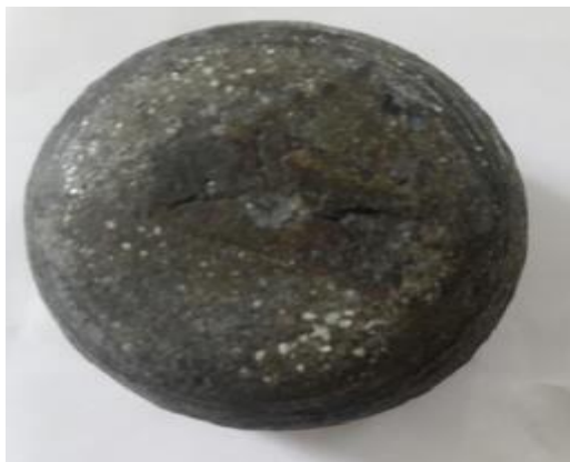
Figure 4: MMC (Al 6351+7.5% of Al_2O_3 )