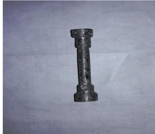
Figure 6: MMC sample for tensile test