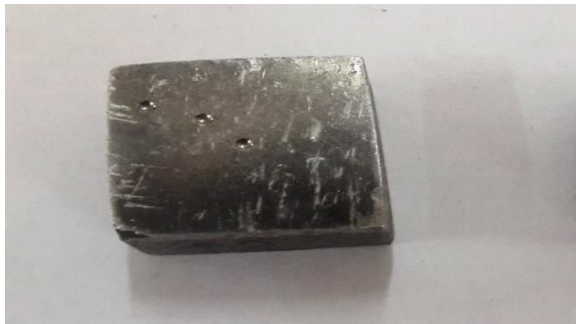
Figure 10: MMC sample after indentation on hardness testing machine.

Al6351/2.5, 5, 7.5% wt. Al 2 O 3 composite were prepared as per dimension (10 mm x 10 mm x 25 mm) as ASTM E18-05, standard.