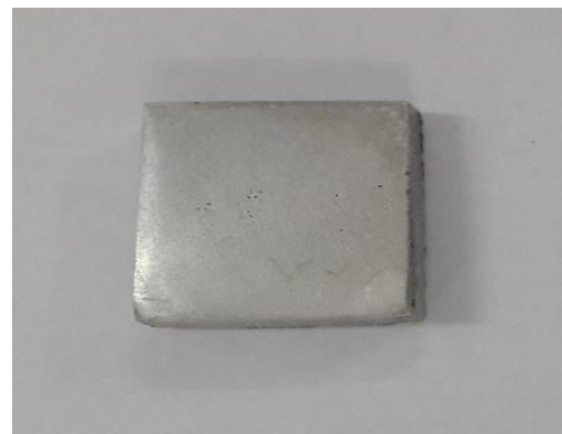
Figure 8: MMC sample prepared for microstructure