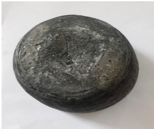
Figure 2: MMC (Al 6351+2.5% of Al_2O_3 )

electrically driven machine which is used to cut the hard composites. The MMC samples prepared are shown in figures given below.